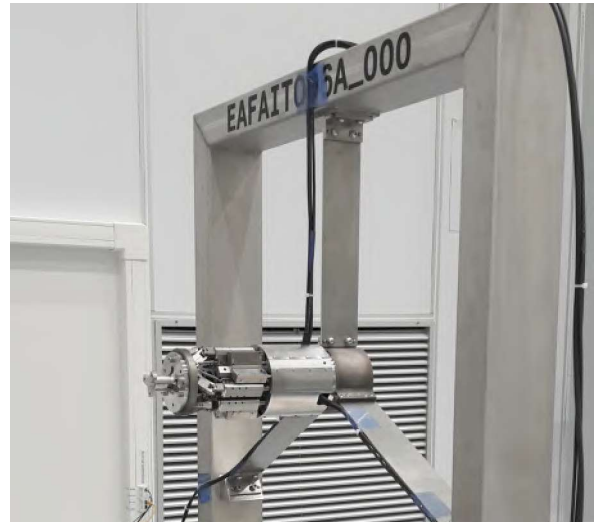
MAUKA hexapod has a very small diameter of 107 mm.